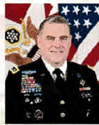
United States Army Chief of Staff General Mark. A Milley