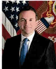
Secretary of The Army Honorable Eric K. Fanning