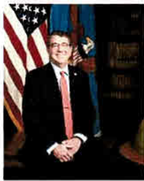
Secretary of Defense Honorable Aston B. Carter