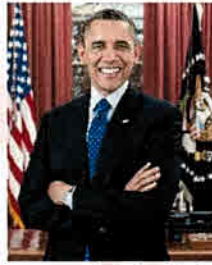
Commander-in-Chief Honorable Barrack H. Obama