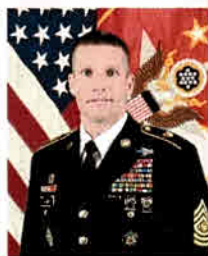
Sergeant Major of the Army SMA Daniel A. Daily